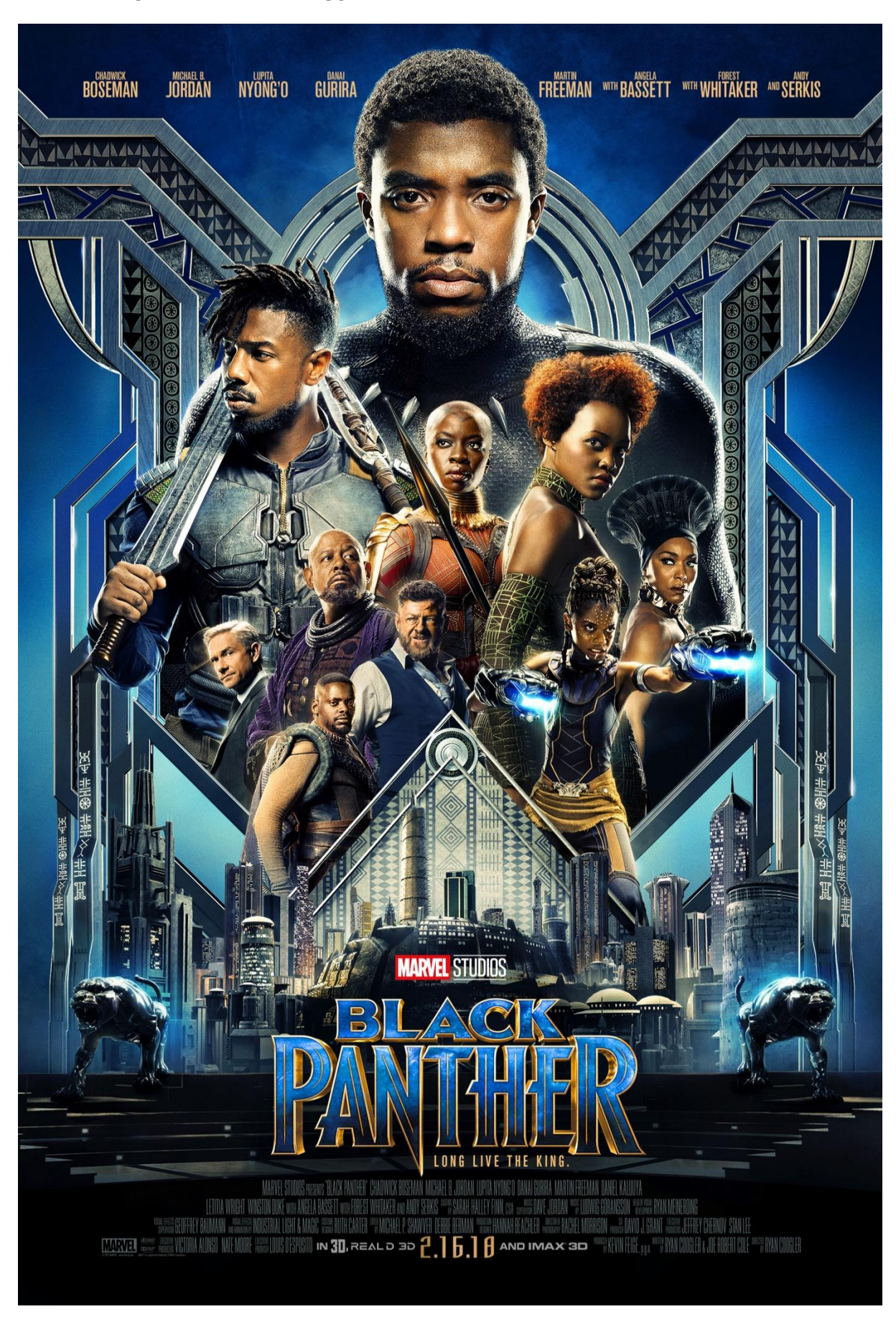
TEXT B: BLACK PANTHER FILM POSTER